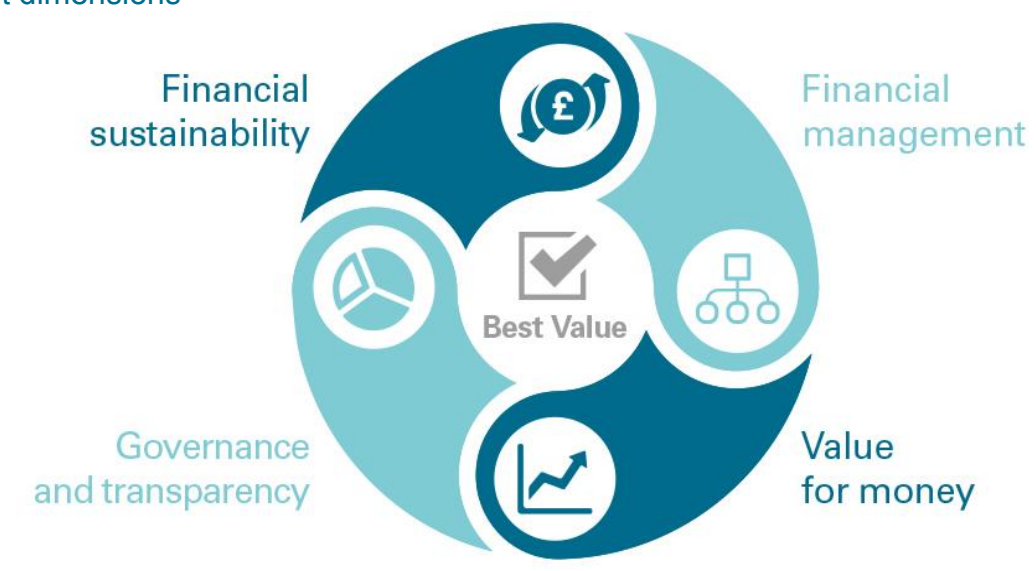
Exhibit 1 Audit dimensions